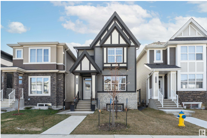
8149 226A St NW, Edmonton, AB

This two-story home offers 5 bedrooms, 4 bathrooms, a fully finished basement with a legal suite, and a detached double garage. The main floor includes a kitchen, living room, dining room, one bedroom, and a full bathroom. Upstairs, you'll find three spacious bedrooms and a shared bath, with the primary bedroom featuring a walk-in closet and ensuite. The basement legal suite has a separate entrance, providing added convenience. Located close to schools, shopping, and amenities, with quick access to the Henday.