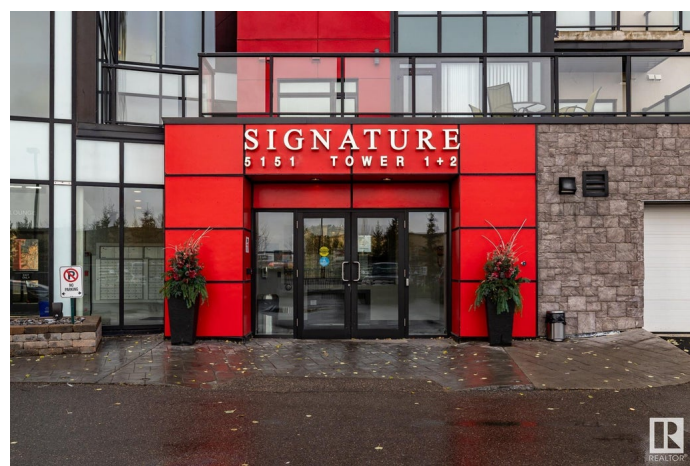
516-5151 Windermere Blvd, Edmonton, AB