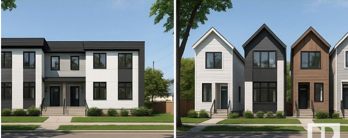
4-PLEX SKINNY HOMES