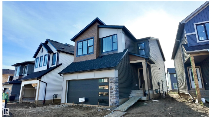
MAIN FLOOR 965 SQ. FT.

Located in the highly sought-after community of Edgemont in West Edmonton, this beautifully designed 2-storey home offers 4 spacious bedrooms, a main floor den, upper floor laundry, and a generous bonus room. The open-concept main floor features elevated ceilings and a chef-inspired kitchen with quartz countertops throughout and a massive walk-in pantry. All appliances are included! Enjoy the convenience of a side entrance, ideal for a future basement suite, and the comfort of higher 9' ceilings on both the main and basement levels. West-facing backyard provides evening sun and will be fully landscaped in summer 2026. Walking distance to playgrounds, a strip mall, daycare, and scenic ravine trails—this home perfectly combines lifestyle and location. A must-see for families looking for space, style, and future potential! *Some photos are of another similar home and are not representational of exact finishing*